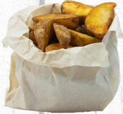
RUSTIC FRIED POTATOES